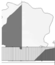
West Elevations Proposed